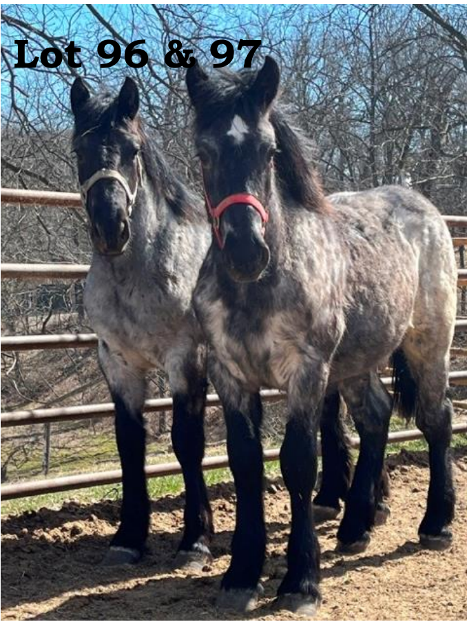
Lot 96 & 97