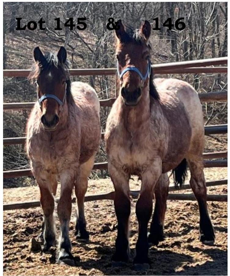
Lot 145 & 146